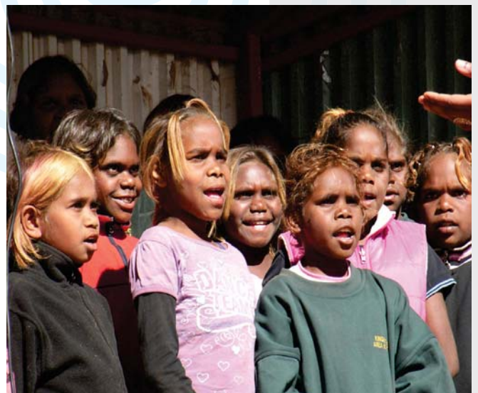
The Tjitji Choir perform as part of the celebration marking the restoration.

The Ernabella Church will be restored thanks to the Pukatja Aboriginal Community, Federal Government, the Church of Scotland and individual donors.