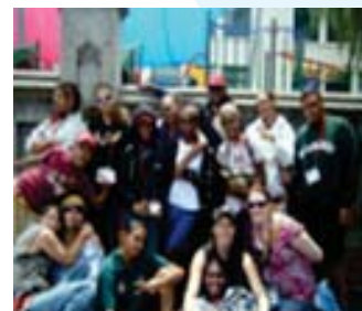
Mapoon - Weipa Napranum Uniting Church young people.

The Traditional owners were pleased to provide the opportunity for young people to become aware of possibilities for their lives and develop relationships with young people from around Australia as well as to strengthen their Christian faith. The young people, who are regular Uniting Church activity attendees, are leaders amongst their peers in their communities and are future community leaders in Cape York. The growth in their spiritual maturity was obvious as they attended Bible Studies, prayed, learnt new worship songs and talked with other Christian young people from around Australia.