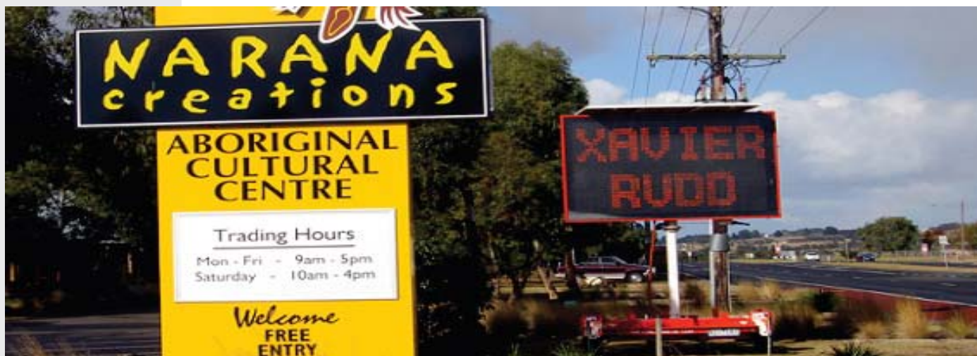
With a gallery stocking 100% genuine Aboriginal art and craft, Narana Creations provides a market and thus an income for Indigenous artists.