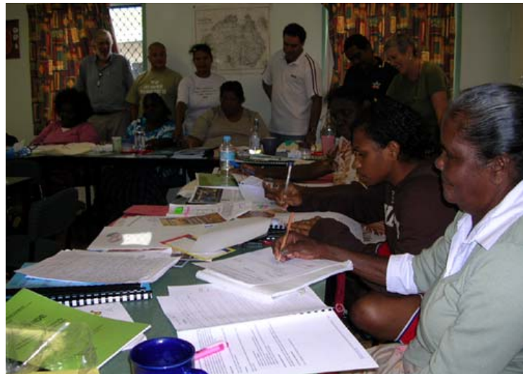
Christian Ministry students undertake a communications unit as part of their course.

As part of the UAICC's desire to equip its future leaders with a holistic range of leadership skills, a communications course has been integrated into the Certificate IV in Christian Ministry. Both courses are run by the Yalga-binbi Institute for Community Development.