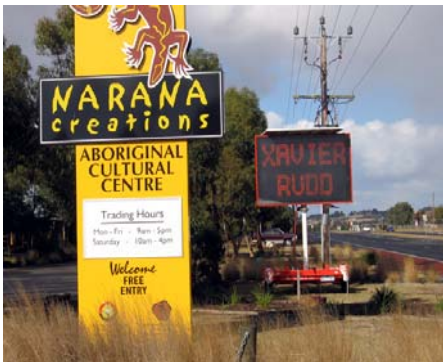
Narana Creations a winner of several Victorian Government Tourism awards.

Narana also provided an alternate feast, a feast to stave off the pangs of hunger and thirst. We served coffees endlessly from our Cafe, and a group of volunteers from a local Uniting Church congregation sold soft drinks and water to the people who developed a thirst with their dancing. Our Juvenile Justice Group helped by a group from one of the local Uniting Church schools served "snags and onions" in slices of bread with lashings of sauce to keep the wolves from the door.