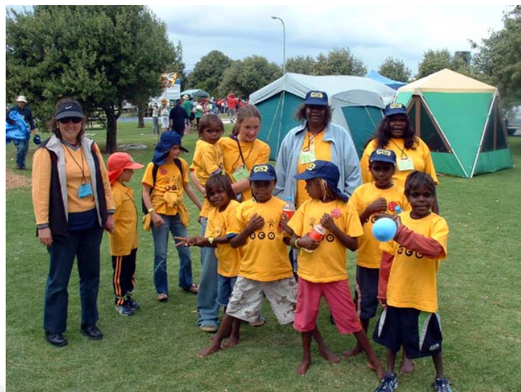
The KUCA Camp allowed children of many different backgrounds to experience the wider Church family.

The Annual Kids of the Uniting Church of Australia (KUCA) Camp Out held at West Beach in Adelaide attracted the usual 3,000 children and adults from across South Australia and Broken Hill.