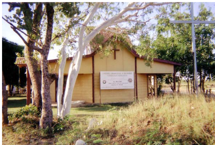
The Congress Church at Gununa on Mornington Island.