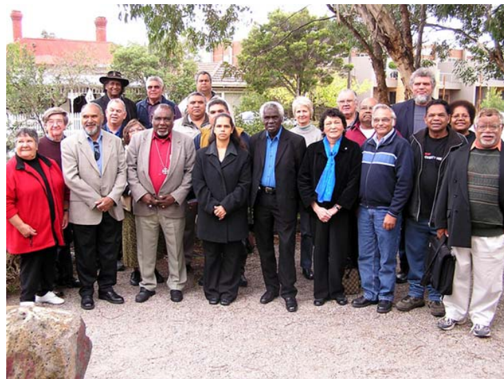
Delegates from the proposed Alliance of Indigenous Christian Bodies.