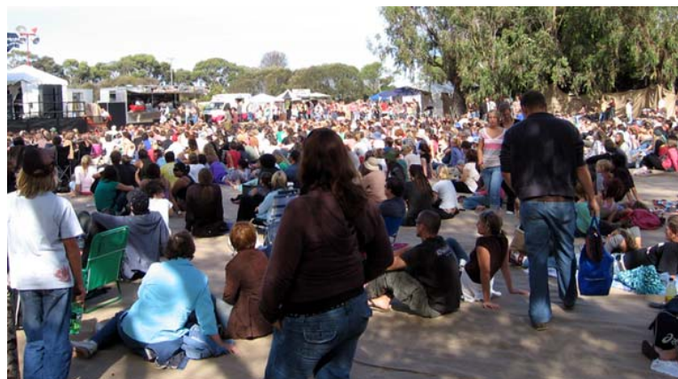
Proceeds from Narana Fest 2006 will be directed to the 'Respect for the Spirit' Program which aims to deliver cultural education to the youth of Geelong.