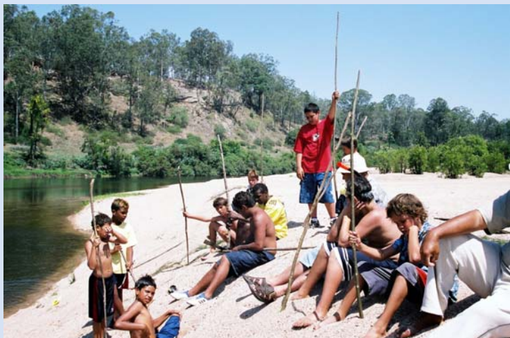
Young participants at the Tingha cultural camp.

The Korean Temperance Union joined us for fellowship for one night and provided us with delicious Korean food for dinner. They also ran a workshop with the kids on drug and alcohol and handed out gifts for the children. Everyone enjoyed the few days at Tabulam. We look forward to the next Cultural Youth Camp to be held in January at Copeton Dam, hosted by Tingha Congress members.