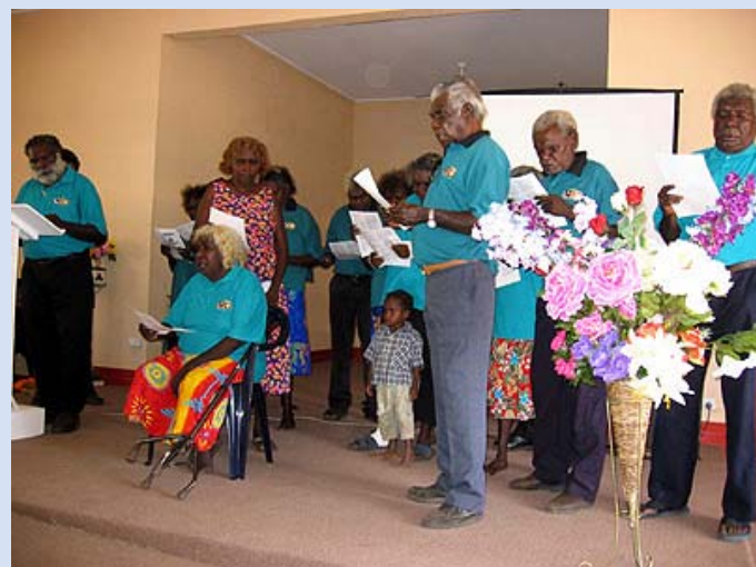
Aurukun Elders leading a worship.

Other positive signs of development include families linked with these new elders, are bringing their children for baptism and the ongoing activity of the