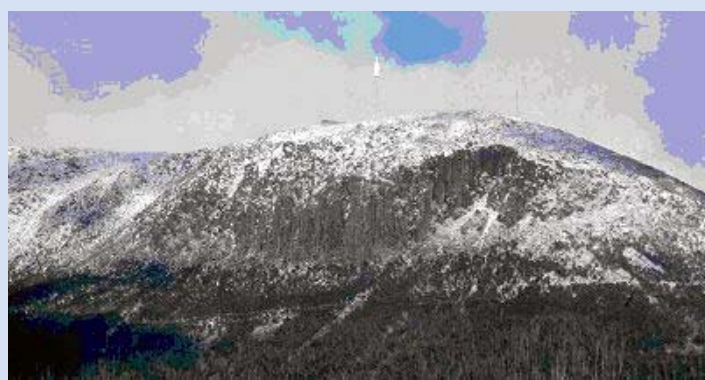
The dramatic backdrop of Mt. Wellington in Hobart, Tasmania reminds one of the significance of mountains in the bible as special places of prayer.

An old gospel tune gained some new and very local words as the Congress congregation at Leprena brought together culture, gospel, personal stories and church traditions around the theme of “mountains.” Over a number of weeks stories were shared about rock carvings engraved thousands of years ago, of Christmas traditions on the Cape Barren Island Reserve, of family walks and of the many occasions in the Bible when mountains are revealed as being places of prayer.