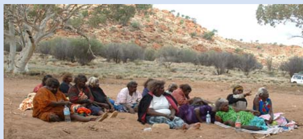
Some women at Pukatja who attended the historic meeting.

Northern Synod of the Uniting Church along with the NRCC and included visitors from the South Australian Synod, the South Australian Congress, Frontier Services and the National Congress Office. Local Anangu (Aboriginal) people were well represented. The September meeting was held in response to calls from the Anangu people for assistance with Ministry in the APY lands.