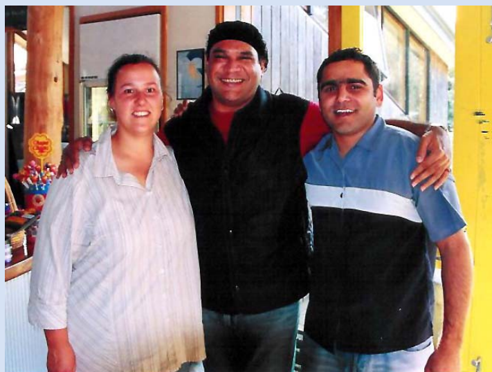
Narana staff were delighted to meet Mark Olive (centre) who may present one of his famous cooking shows from Narana Creations.