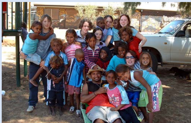
Some young people from Adelaide mix with the local Ernabella tjitji [children] on the recent trip organised by Congress