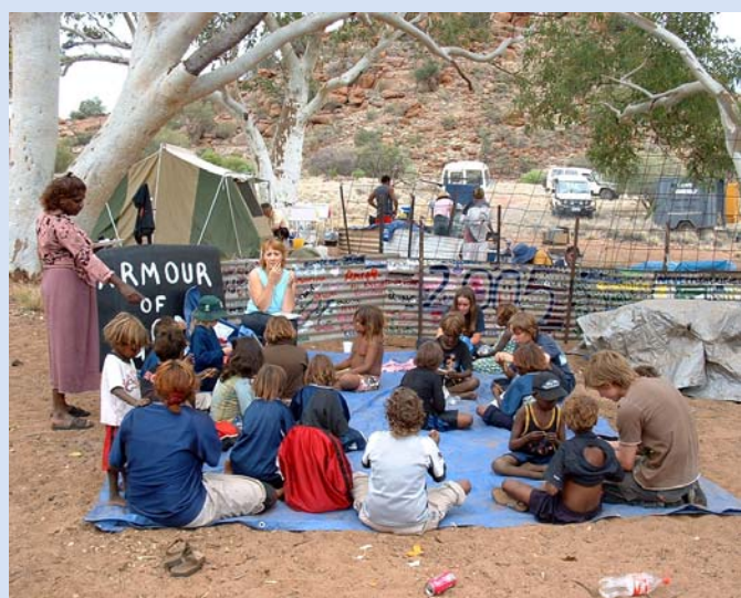
An old car bonnet is used to represent the 'Armour of God' in an exercise that brought to life some of the scriptures in Ephesians Chapter 6.

trip followed a visit held in December 2004 which was designed to encourage young Indigenous people to come to NCYC (National Christian Youth Convention) in Adelaide last January. The inaugural visit was successful as over 200 Anangu (Aboriginal people) from the APY (Anangu Pitjantjatjara Yankatjatjara) land attended NCYC. On this visit, fellowship and worship was focused around the theme 'Armour of God'. The singing of the Anangu children was a highlight of the week. They also enjoyed all the painting, sport and other activities which were part of the program.